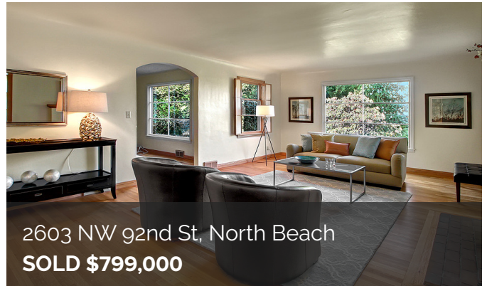
2603 NW 92nd St, North Beach SOLD $799,000