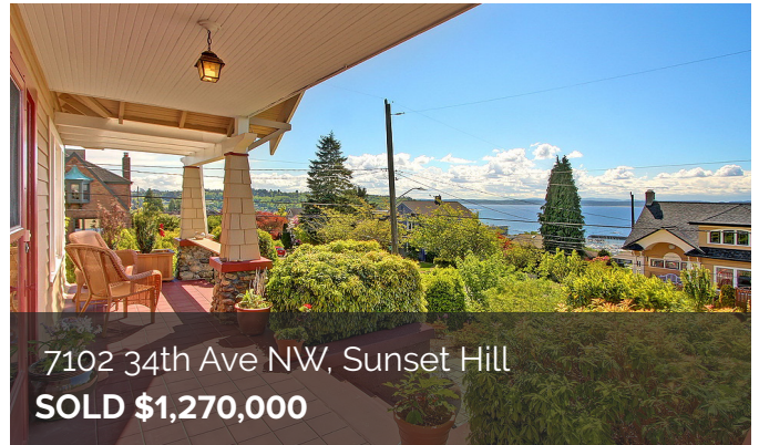
7102 34th Ave NW, Sunset Hill SOLD $1,270,000