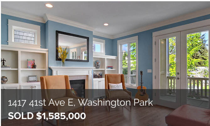
1417 41st Ave E, Washington Park SOLD $1,585,000