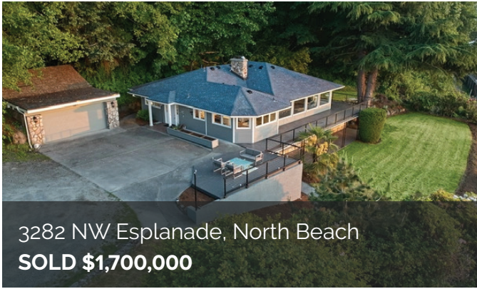
3282 NW Esplanade, North Beach SOLD $1,700,000