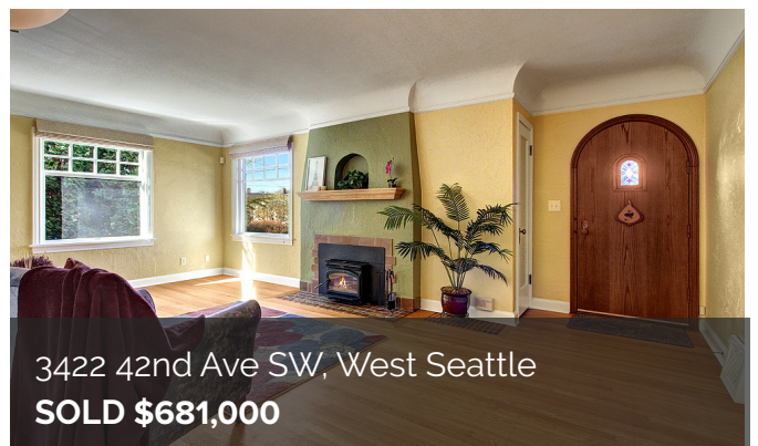
3422 42nd Ave SW, West Seattle SOLD $681,000