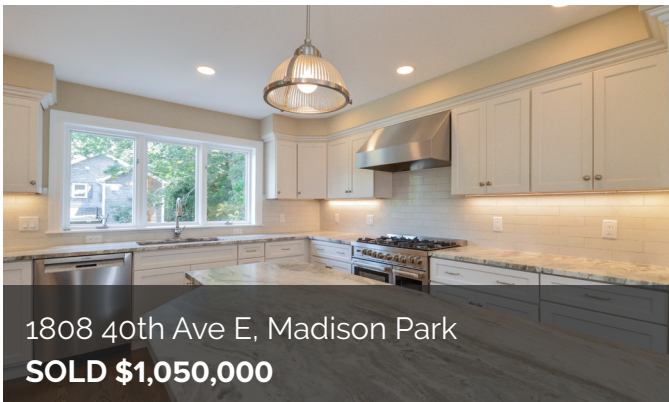
1808 40th Ave E, Madison Park SOLD $1,050,000