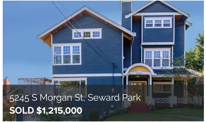
5245 S Morgan St, Seward Park SOLD $1,215,000