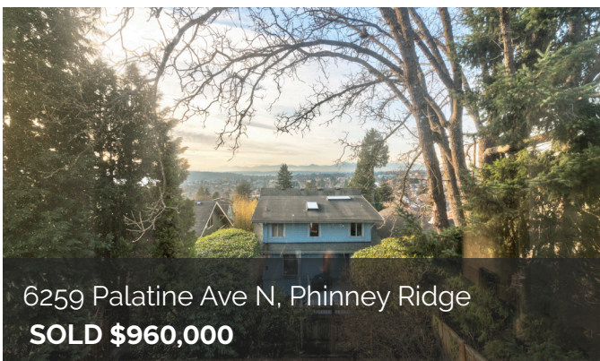
6259 Palatine Ave N, Phinney Ridge SOLD $960,000